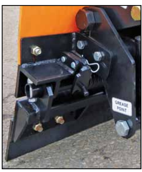
Adjustable Trip-edge: (6) adjustable torsion springs