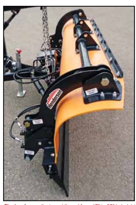
Flexing Arm: adjusts moldboard from 17" to 35" in height

Each torsion spring has a 2-position tension adjustment. Release spring tension completely for zero insertion