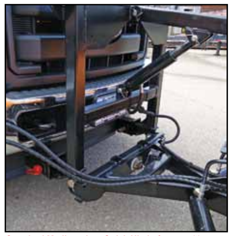
Standard Medium-duty Quick Hitch: for use with MTP & MTP-Flex.

force and optimum safety during service and maintenance work.